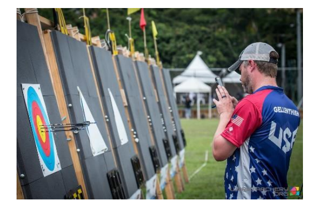
99.3 What is your reaction to the picture? What action would you take?

So as Chair of judges you should reinstate the points that were taken away from the teams. Then find out what happened with the timing and make sure it does not happen again, at least not without any response from the DOS or line judge.