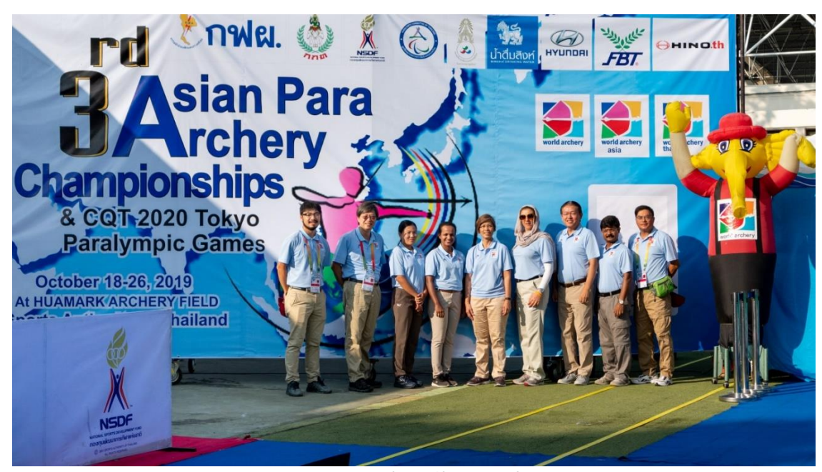
Asian Para Archery Championships