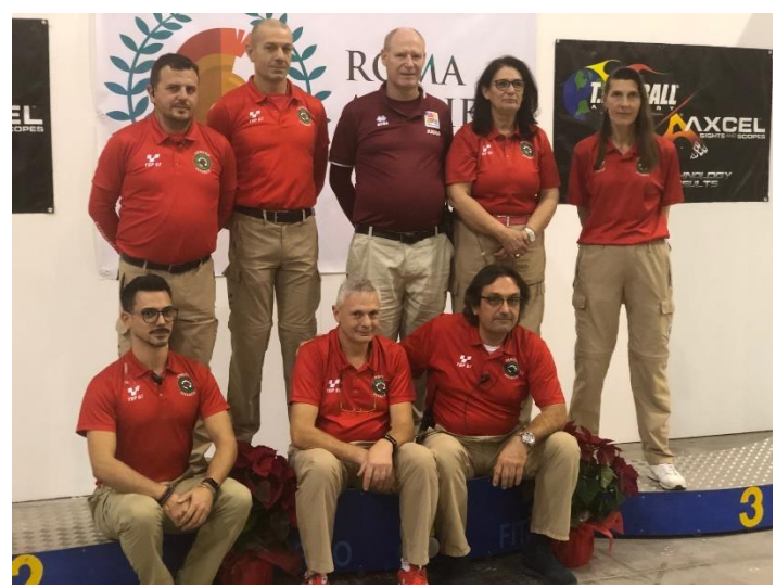
Indoor World Series in Rome